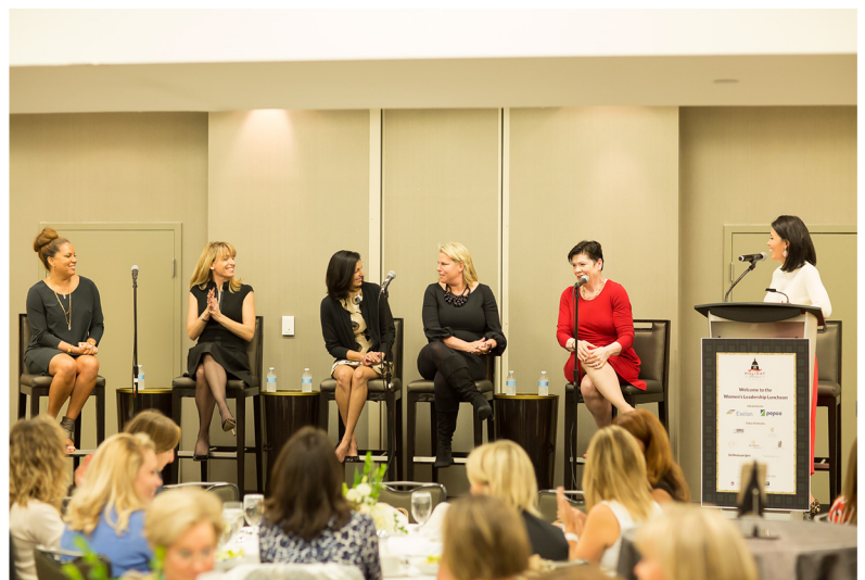
JLW's Women's Leadership Luncheon featured a panel of DC's most influential women at the DC Renaissance Hotel.