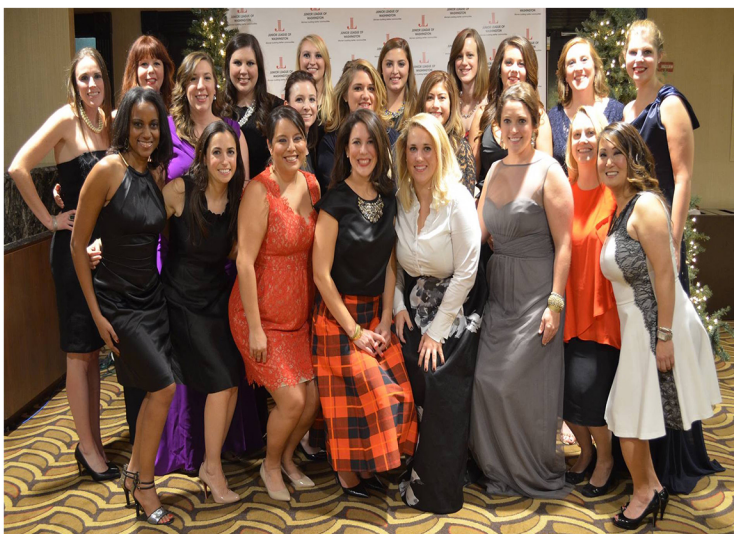
The Holiday Shops Committee celebrates at one of its special events, Soiree.

Thank you to our members and supporters who made this year a success!